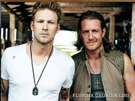
FLORIDA GEORGIA LINE